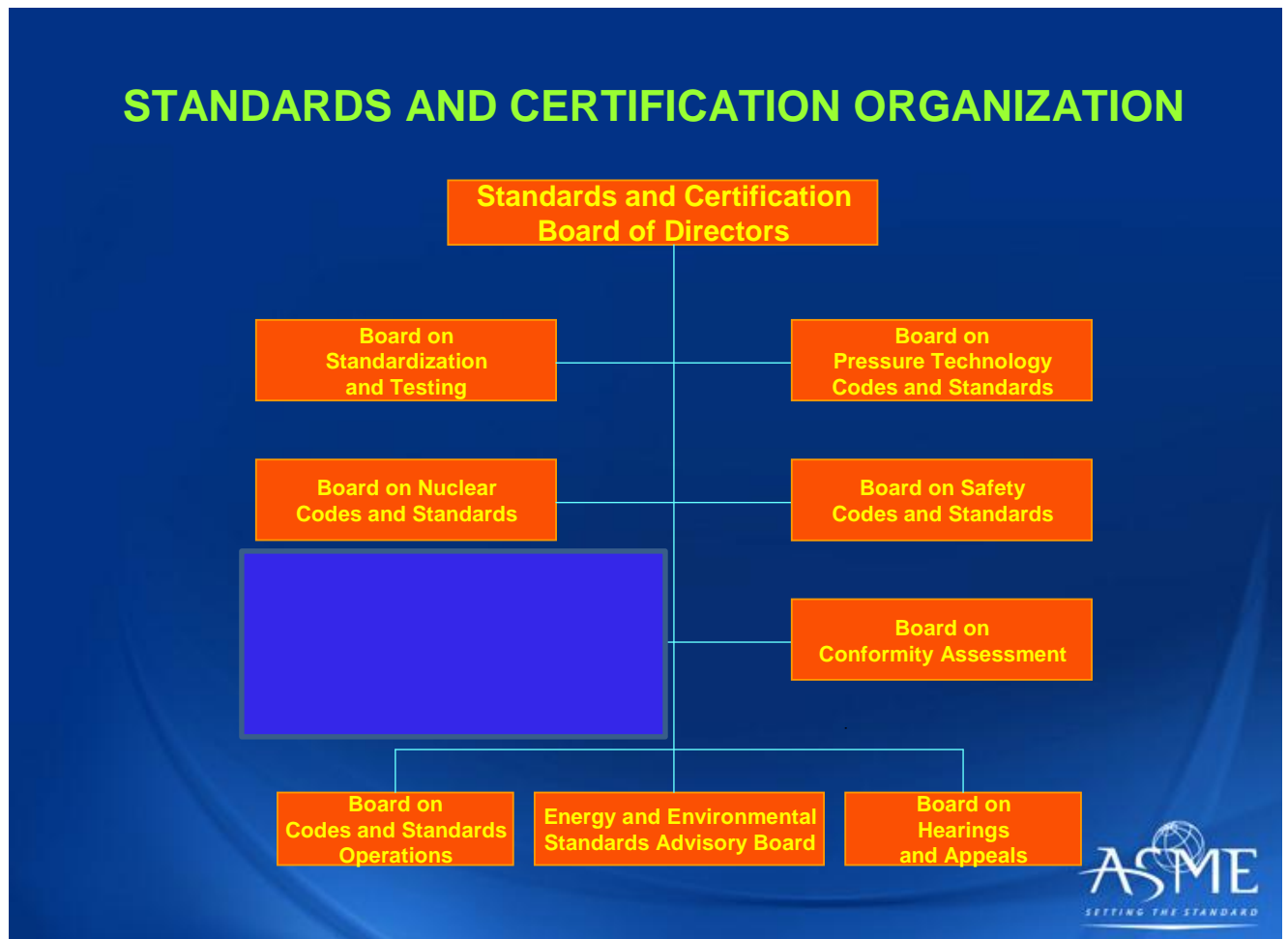
Figure 5-2: ASME Standards and Certification Organization