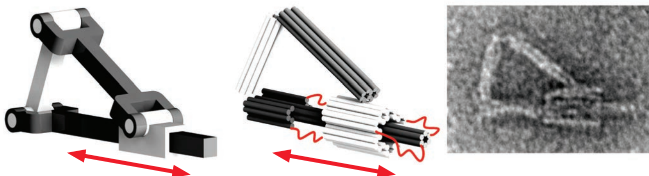
A crank-slider mechanism (left) converts the energy of a rotating wheel into a linear back-and-forth motion, or vice versa. The authors built a crank-slider mechanism from DNA (center) by combining DNA origami links and joints. They used electron microscopy (right) to visualize the tiny device and confirm that it actually moved.

formed the design of DNA scaffold origami from art to engineering. Now we can generate 2-D blueprints for DNA origami structures using an open-source computer-aided design program, caDNAno, then run those blueprints through simulation software called CANDO (Computer-Aided eNginneering for DNA Origami) to predict a 3-D folded structure.