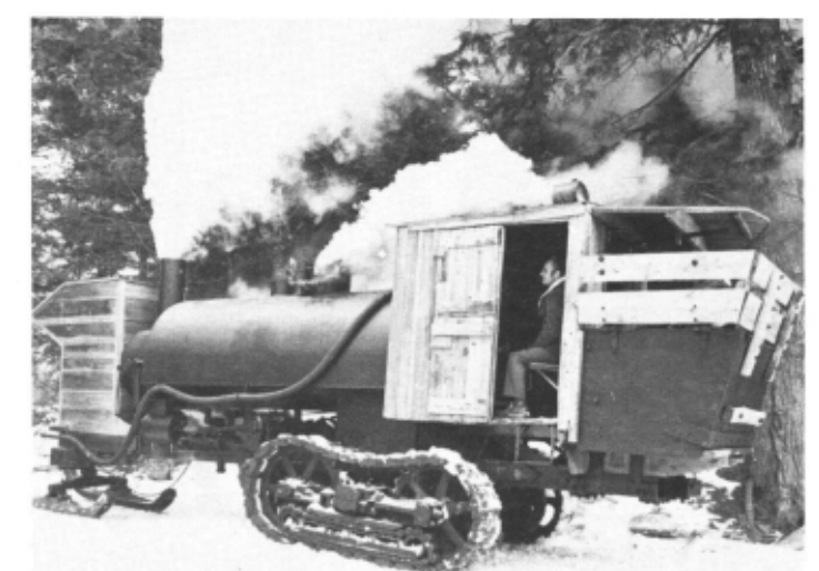
On an icy road "Lombards" could pull a long string of sleds loaded with logs.

A woodburning "Lombard" (c. 1900-1910) built in Waterville, Maine. It was put into operating condition February 7, 1980 for a twomile run—its performance was deemed "superb".