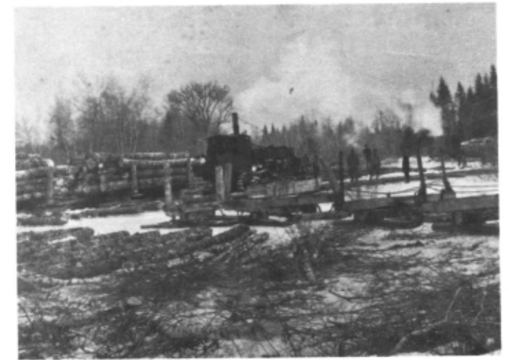
A "Lombard" could haul 300 tons of wood at a speed of 4-5 m.p.h.

On large operations coal was the usual fuel...but many haulers on the smaller jobs burned wood. Though coal was easier and spared the risk of ramming out a boiler plug while stuffing the fire box, wood burning among the pines made a log hauler truly independent.