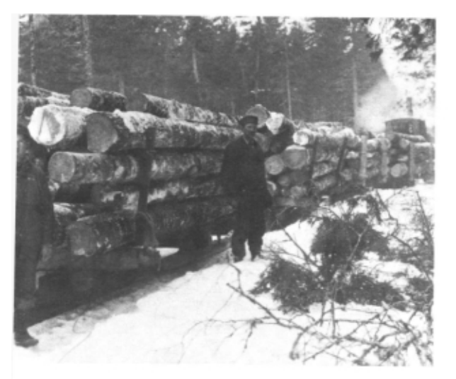
A typical log hauler crew consisted of an engineer, fireman, conductor, and the steerer. The conductor, riding close to the rear, communicated with the cab by a bell rope which ran along the sled stakes.

The first Lombard gasoline engine machine was built in 1909 by Lom-