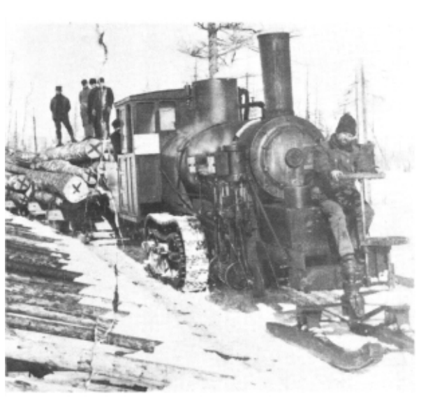
A Peavey Log Hauler, Traction was obtained by revolving screws.

The description, claims and drawings of this patent are restricted to the