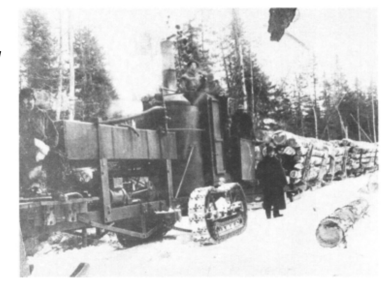
"He has known the crash of the falling spruce...has trod the ruts to the camps long ago...boasted the scale of the heavy loads that cricked o'er the frozen snow..." <u>The Old</u> <u>Lumberman</u>, Harold P. Andrews.

Early type of Lombard Steam Log Hauler with upright boiler and engine.