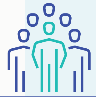
Emerging Volunteer Leaders Across the Society