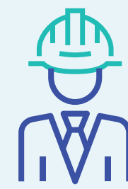
Early Career Engineers