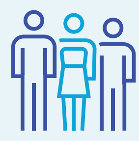
Diversity, Inclusion, and Implicit Bias