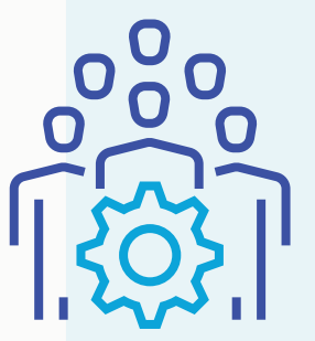
ASME and Its Volunteer Community

VOLT’s Trainings Cover a Broad Range of Topics, Including: