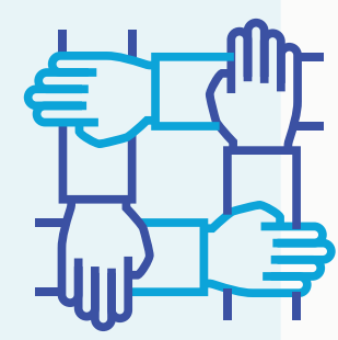
Working Effectively in Teams

To learn more about VOLT and how to participate in VOLT programs, visit go.asme.org/volt .