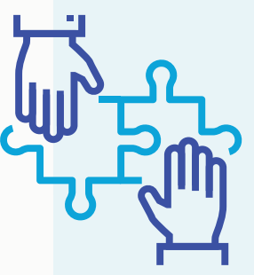
Collaboration, Cooperation, and Negotiation