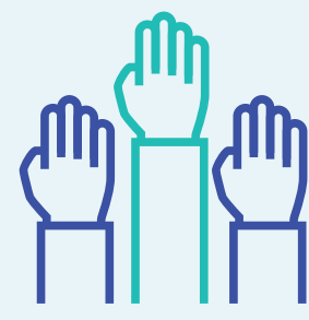
Volunteers at All Levels